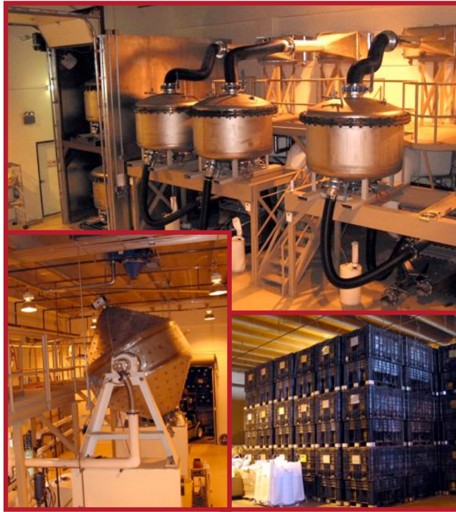
Figure 3. Facility for manufacturing atoxigenic strain material run by the Arizona Cotton Research and Protection Council in Phoenix, Arizona. The process and facility were developed by a partnership between ARS and ACRPC.